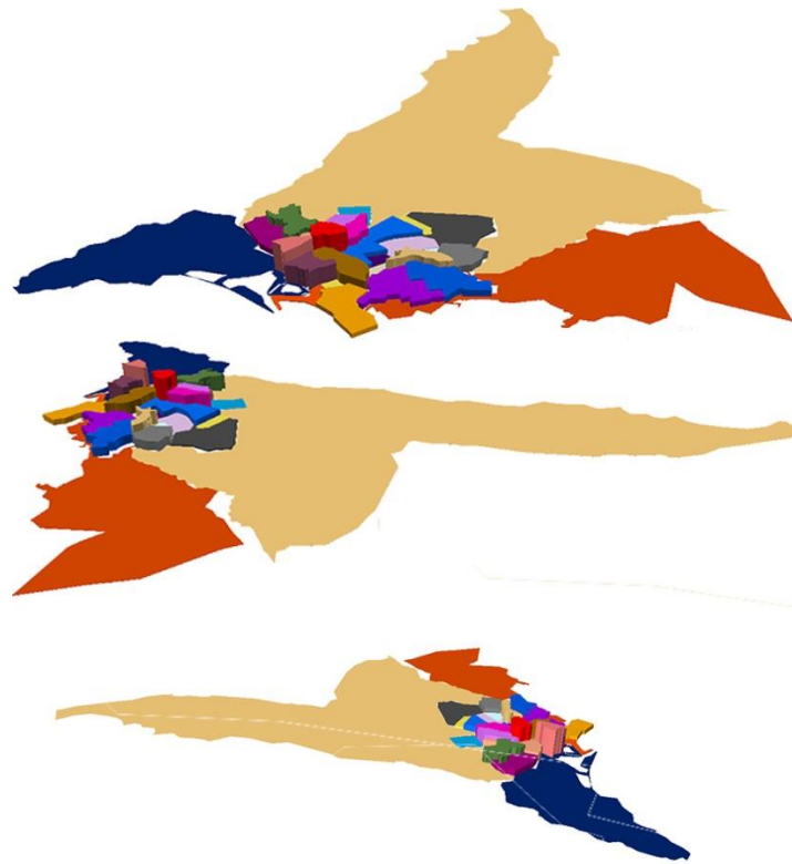
Population density of karachi respective to Areas in year 2016